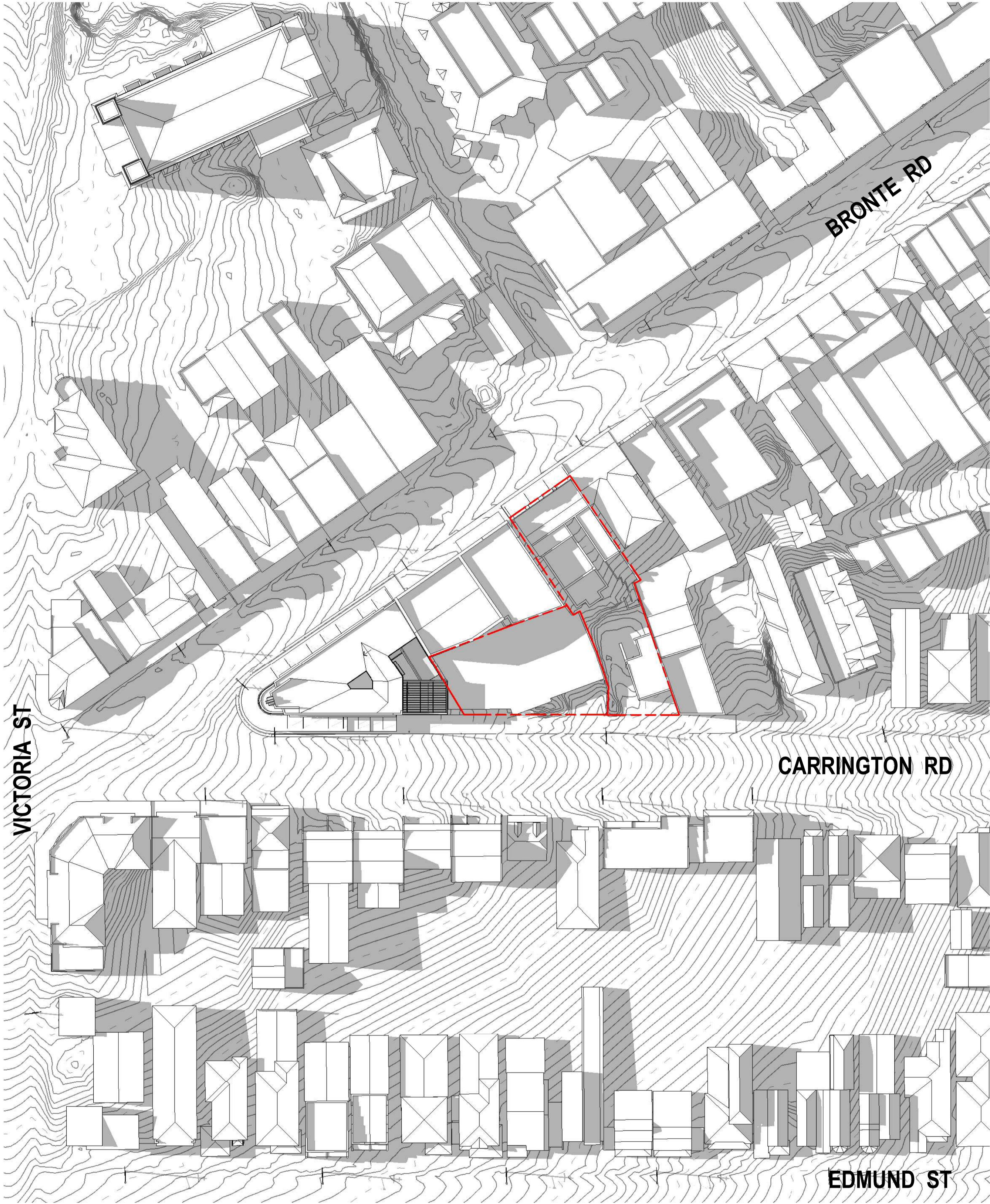
1 Shadow Plan - Existing - Winter Solstice 11:00AM 1 : 500

General Notes The copyright of this design remains the property of H&E Architects. This design is not to be used, copied or reproduced without the authority of H&E Architects. Do not scale from drawings. Confirm dimensions on site prior to the commencement of works. Where a discrepancy arises seek direction prior to proceeding with the works. This drawing is only to be used by the stated Client in the stated location for the purpose it was created. Do not use this drawing for construction unless designated.